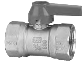
1 Piece CSA Gas Ball Valve (1/2" & 3/4")