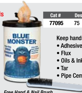
Free Hand & Nail Brush included in each container!

BLUE MONSTER scrubbing towels are pre-moistened, heavy-duty cleaning towels dispensed from a handy, flip-top container. They are saturated with a safe, effective cleaning solution combined with a tough, dual-textured towel to loosen, dissolve and absorb dirt and grease leaving your hands clean. One side is rough for scrubbing and the other side is smooth. These towels require no water and leave hands feeling conditioned and clean with no left-over residue.