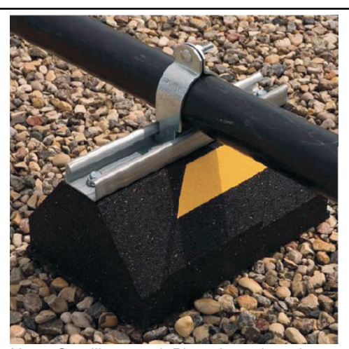
Note: C10 illustrated. Pipe clamp by others.