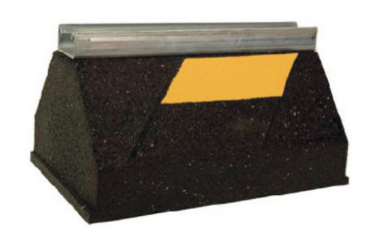
Note: C10 illustrated.